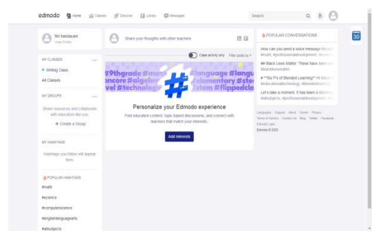
Figure 3. Edmodo display.

Edmodo as a medium to give tasks and quizzes, providing feedback and grades from students' work, storing and sharing writing content material in files and links. For students, Edmodo provides a space for having cooperation and interaction among them. They can easily have contact with each other in sharing information, exchanging ideas, utilizing writing as the medium of communication. The display of the Edmodo site can be seen below.