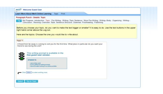
Figure 1. Paragraph Punch display

To get practice in paragraph writing, this site offers 15 writing topics and 1,548 help prompts to lead students through each step in the writing process (Merit Online). In the program, the students can also learn a distinct way to write a paragraph: through reasons, details, sequences, examples, and causes and effects. The display of the site can be seen below.